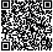
Visit our product page